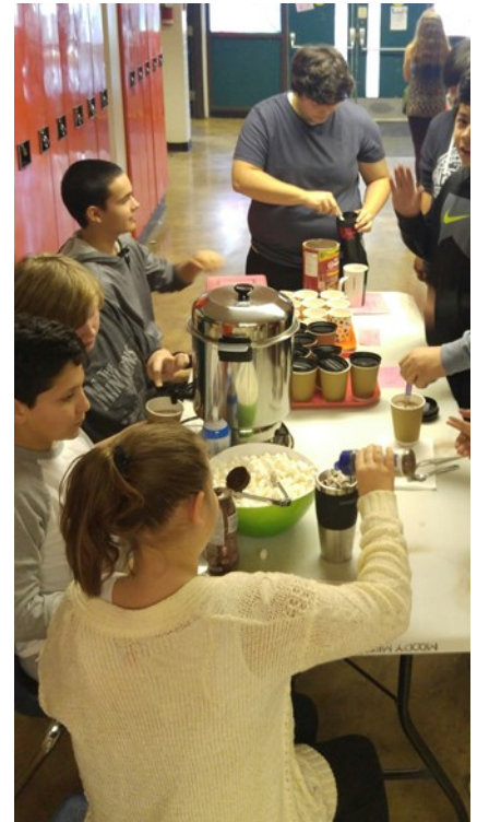
Hot chocolate sale

For more information please contact Christine McLellan at cmclellan@sd43.bc.ca