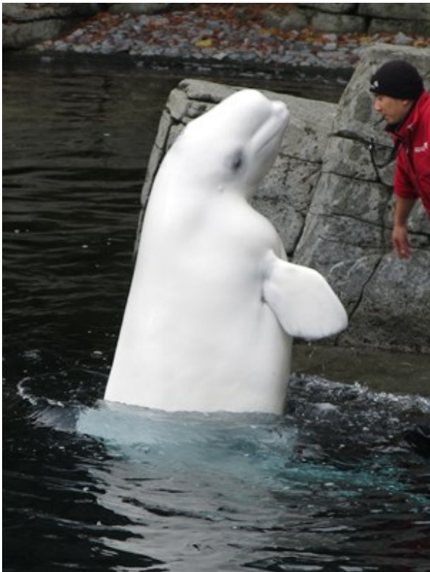
Beluga show at the Aquarium