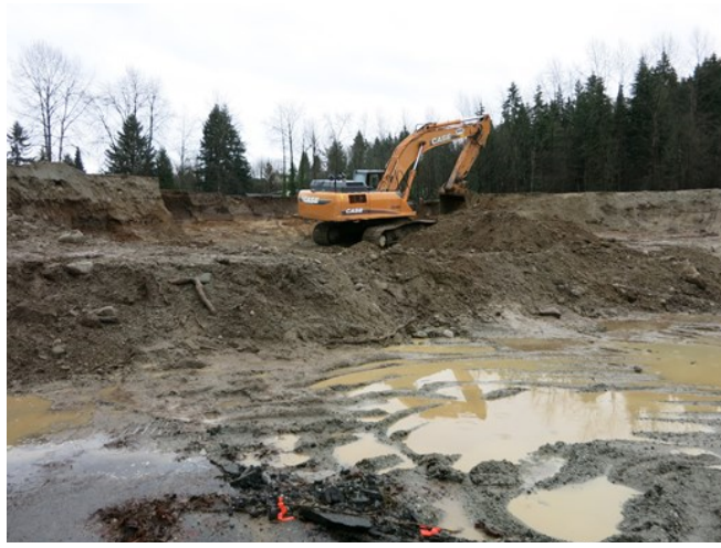
Construction continues — earth removal is now the major project