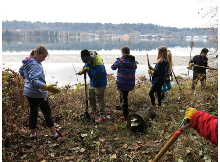
Students from Division 3 participating in the Shoreline Clean-up