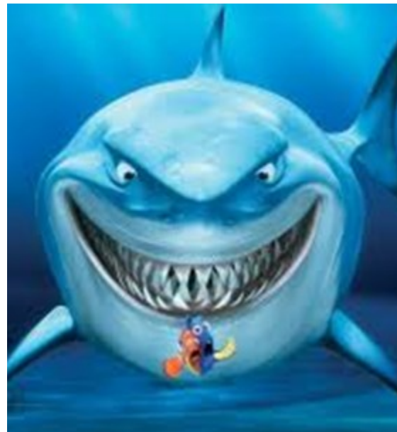
Our water themed musical—coming soon!