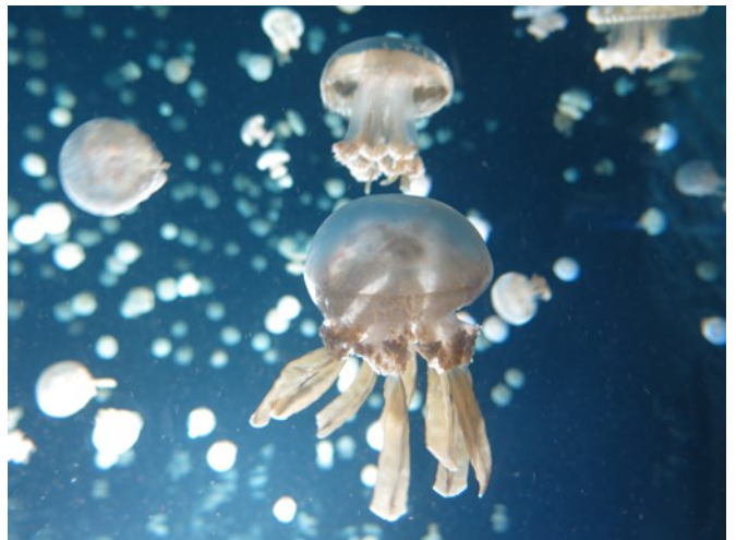
What does a shark eat with peanut butter? JELLYFISH!!